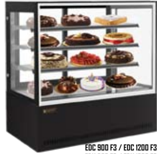
EDC 900 F3 / EDC 1200 F3 EDH 900 F3 / EDH 1200 F3

The stylish confectionery showcase range from Elanpro comes in multiple shapes and sizes with 3 and 4 layers of display option. Elanpro offers showcases in cold, hot and ambient temperature.