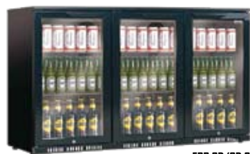
EBB 3D/3D SS