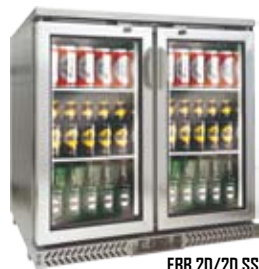
EBB 2D/2D SS

Elanpro Wine Chillers are known for their aesthetics and ease of operation, pull out wooden shelf helps in storage and selection of wine. Twin cabinet with individual temperature control ensures your White and Red wine are perfectly maintained to offer you the experience of Wine at any time. Elanpro back bar come in Black & SS finish.