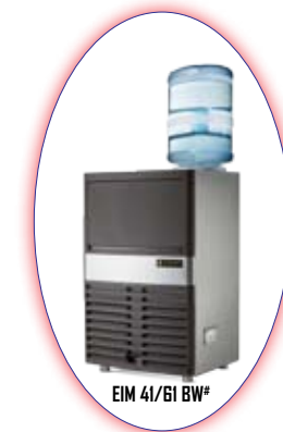
EIM 41/61 BW*