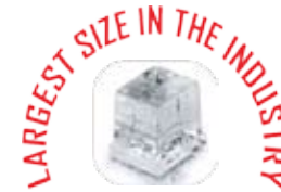
Regular Cube 28 x 32 x 22