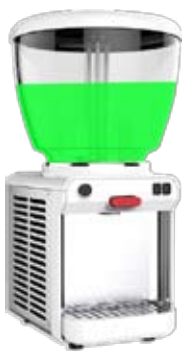
JD LJH 20