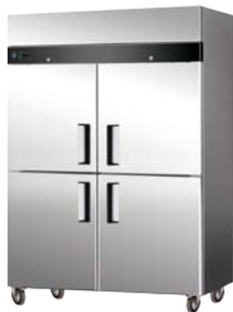
CGN 1410 TNM / BTM RI 1101 C4/F4