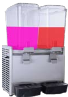
JD LJH 8x2