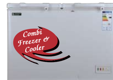
EF 405 (Combi)