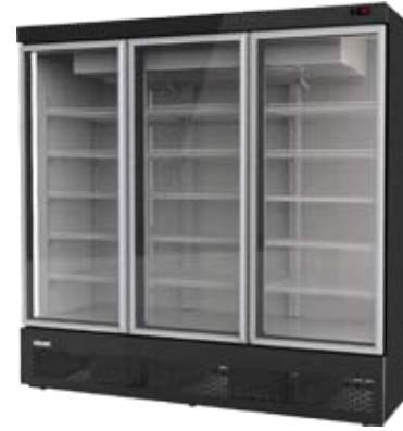
Plug-in Multi Door - Freezer & Chiller SL2D 123 / SL3D 183 / SL4D 245 SM2D 123 / SM3D 183 / SM4D 245