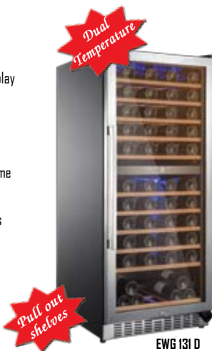
EWG 131 D