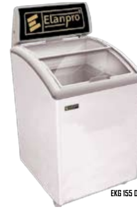
EKG 155 DC

Showcases Freezers - from 55 ltrs. to 650 ltrs.