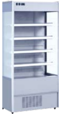
EPM 100 / 150 - Multi Deck