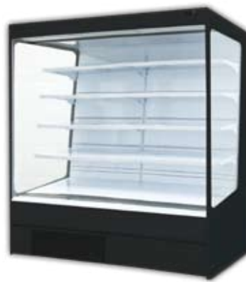
Plug-in Multi Deck / Remote Multi Deck SF 100 / 130 / 200 / 260 RF 188 / 250 / 375