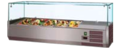
EVRX 1200 / EVRX 1400