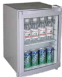
RF 61 G