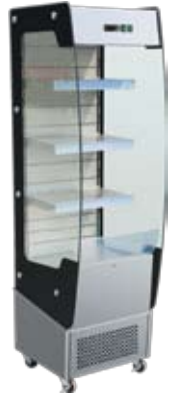
ABSS 220 - Multi Deck

Elanpro brings to India most advanced merchandising solution with innovative cooling options applicable for large hyper mart, super marts as well as modern day kirana stores. Leading brands like Big Bazar, Easy day, Nilgiri, More, CCD patronise on Elanpro solution for their display and merchandising application.