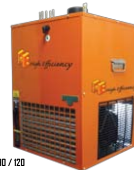
HE 90 / 120

Cooling unit to dispense extra cold beer between 0°C & 2°C and to frost the tower