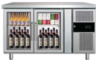
EGN 2100 CG