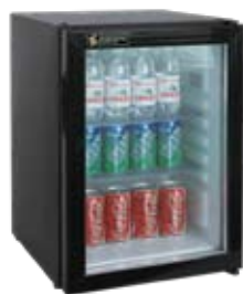
RB 41 G

Elanpro Minibars are designed keeping in mind the room aesthetics and noise less cooling performance for your discerning guest.