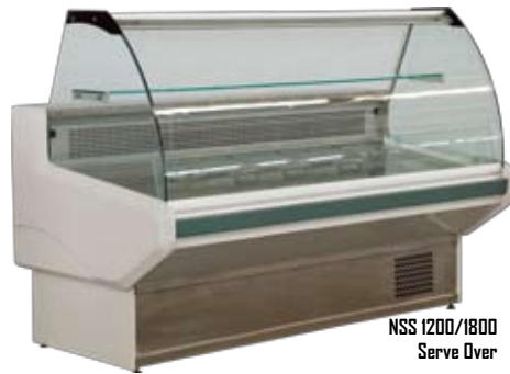
NSS 1200/1800 Serve Over

Available in a very wide range with various sizes to suit all applications. Our range includes: