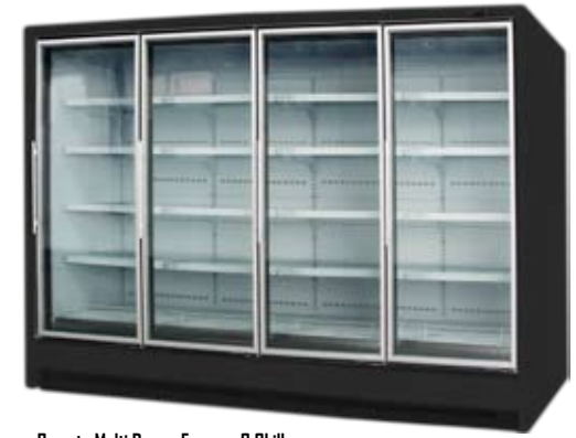
Remote Multi Door - Freezer & Chiller RL2D 156 / RL3D 234 / RL4D 312 / RL5D 390 RL2D 123 / RL3D 183 / RL4D 245 RM2D 123 / RM3D 183 / RM4D 245