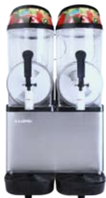
FB X 224