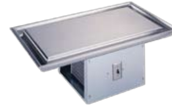
Frost Top 3F