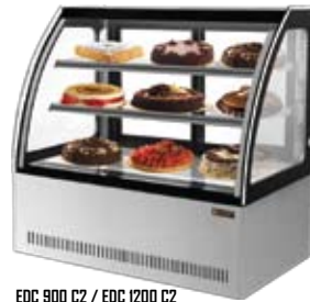
EDC 900 C2 / EDC 1200 C2 EDH 900 C2 / EDH 1200 C2