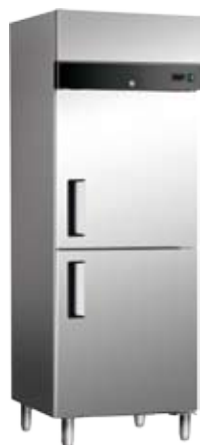
CGN 650 TNM / BTM RI 551 C2/F2