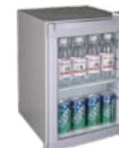
RF 61 G