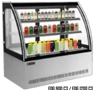
EDG 900 C3 / EDG 1200 C3 Grab & Go