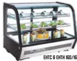
EHTC & EHTH 160/161 EHTC 100