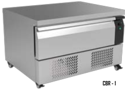
CBR - 1

Elanpro Flex drawer are designed to save space and enhance user experience at a touch of a button. The unique convertible feature helps in converting freezer to fridge and vice versa.