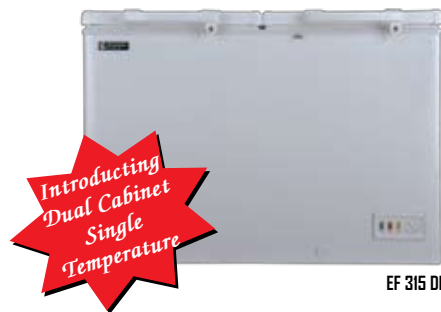
EF 315 DD

Elanpro convertible hard top chest freezers conveniently double up as chillers and freezer with the help of a knob and are available in a very pleasing white and grey shades in sizes ranging from 100 to 818 litres to suit every need. You can also choose between single, double and three lid variants.