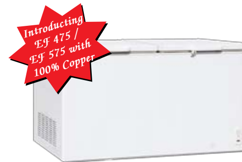
EF 455/EF 475 EF 555/EF 575