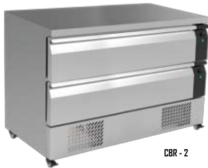
CBR - 2