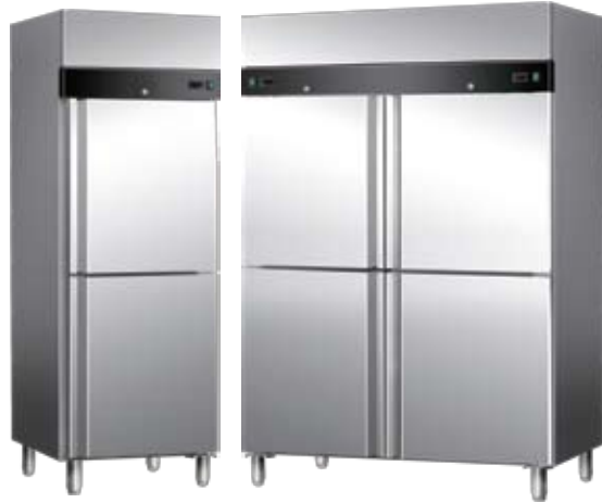
EGN 650 C2/F2

Elanpro Professional Reach Ins for refrigeration or freezer application are designed to meet the tough Indian Kitchen Conditions. Our machines are tested to perform in ambient environment of 40°C and presents a host of exciting new features.