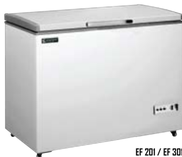
EF 201 / EF 301