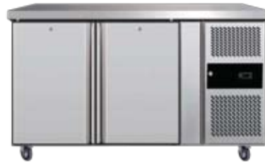
EGN 2100 C/F