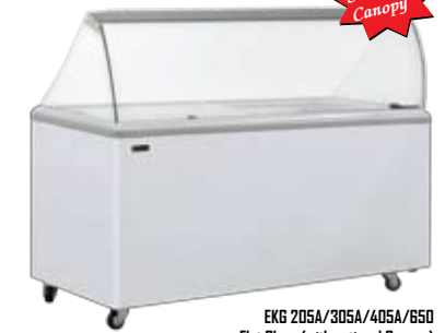
EKG 205A/305A/405A/650 Flat Glass (with optional Canopy)