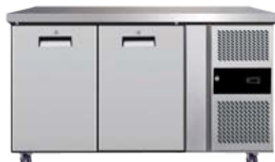
CGN 2100 TN / BT