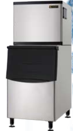
EIM 201 / EIM 351 / EIM 501