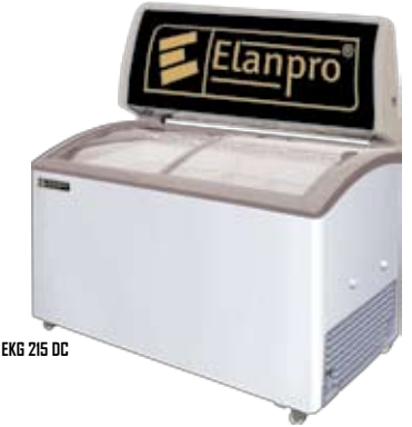
EKG 215 DC