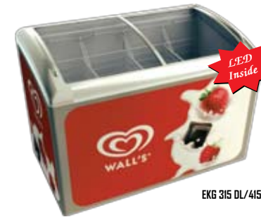
EKG 315 DL/415 DL